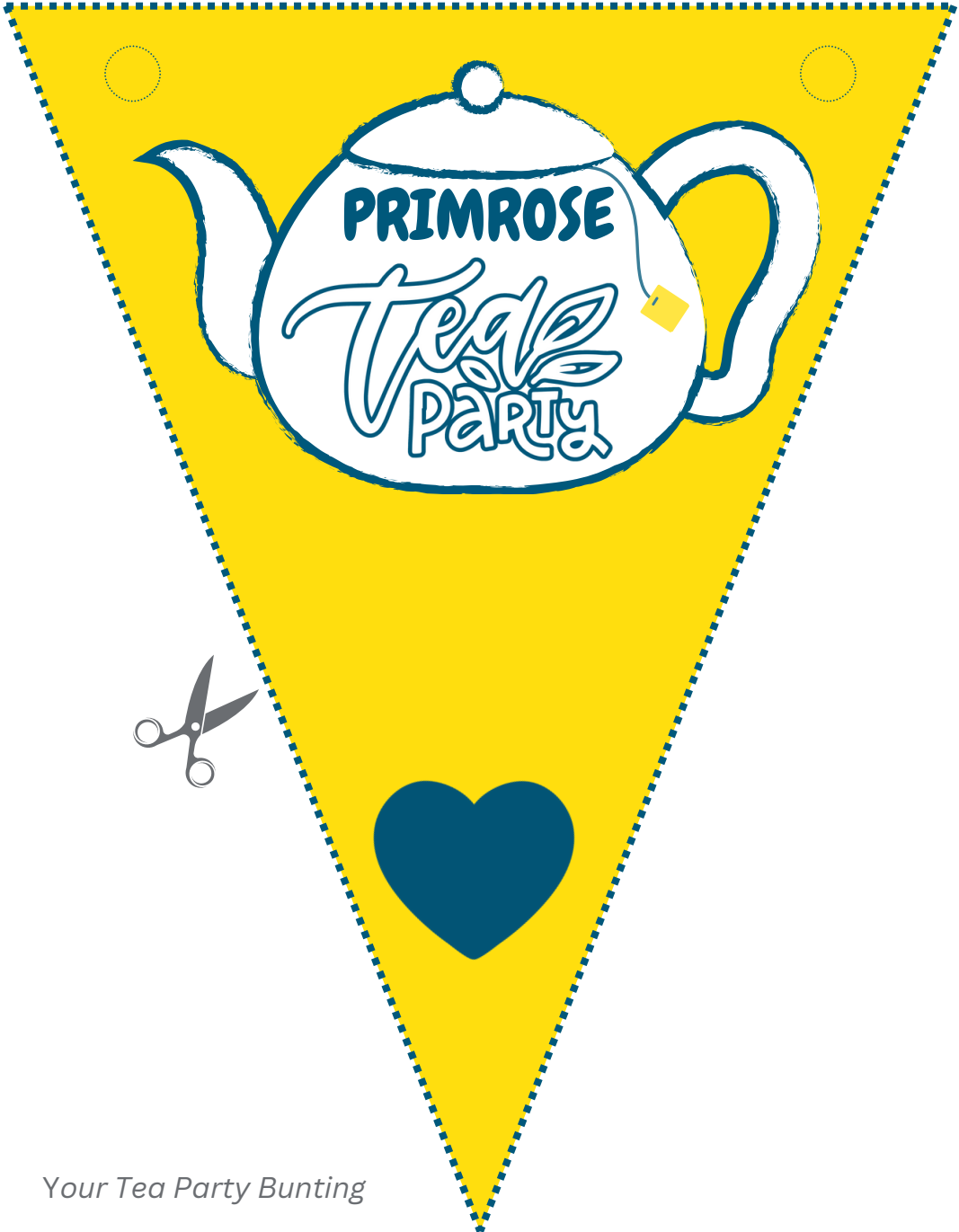
Your Tea Party Bunting